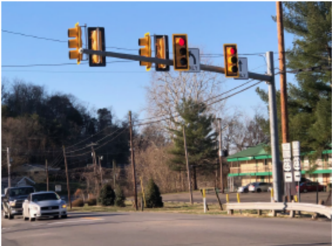
3-way traffic signal installed at the intersection of Scioto Trail (CR-38) & Rosemount Road (CR-377).