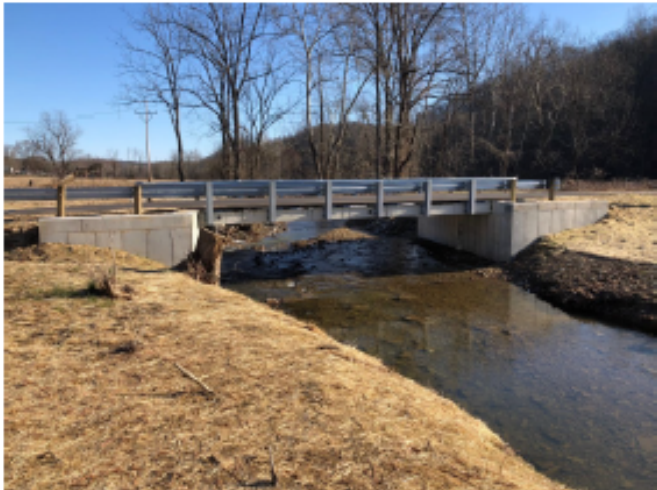
New box beam bridge built on Greenbrier Road (CR-171).